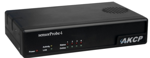
sensorProbe4 Monitoring System

The sensorProbe4 can record all events in its database with a time stamp of when the sensor alarm was raised and the action taken place. A standalone product with no external software dependencies, the sensorProbe4 gives you the very best for your monitoring needs. It has 4 auto-sense intelligent sensor ports which work with a wide range of AKCP intelligent sensors. It can use any combination of sensors to monitor temperature, humidity, water leakage, airflow, security and even control relays.