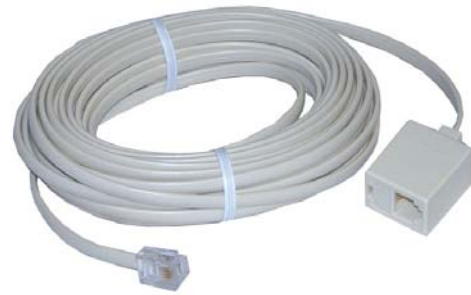
RJ-11 Extension Cable & Coupler ECC-25E-SEN

You may extend the digital sensor up to 100' away from your Room Alert, TemPageR or Wireless Sensor Hub. AVTECH stocks the 25' RJ-11 Extension Cable & Coupler (ECC-25E-SEN) for this purpose. Please contact your Product Specialist to purchase this extension cable.